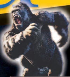
Naomi Watts stars in King Kong . See our review inside.